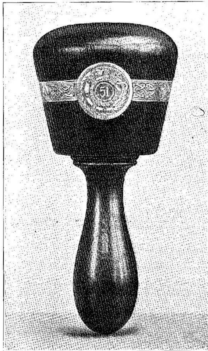
THE MAUL. Presented by "Lodge of Research," No. 200, 29th January, 1916.

The origin of the Maul is very interesting and is well worth recording. Like many another good thing, it was the result of an accident, viz., a chance visit of some of our Dublin brethren to the Bank of Ireland, Dame Street, where repairs were being made to the platform of the old Irish House of Commons. Some small pieces of wood were lying about, and upon a request being made for one of