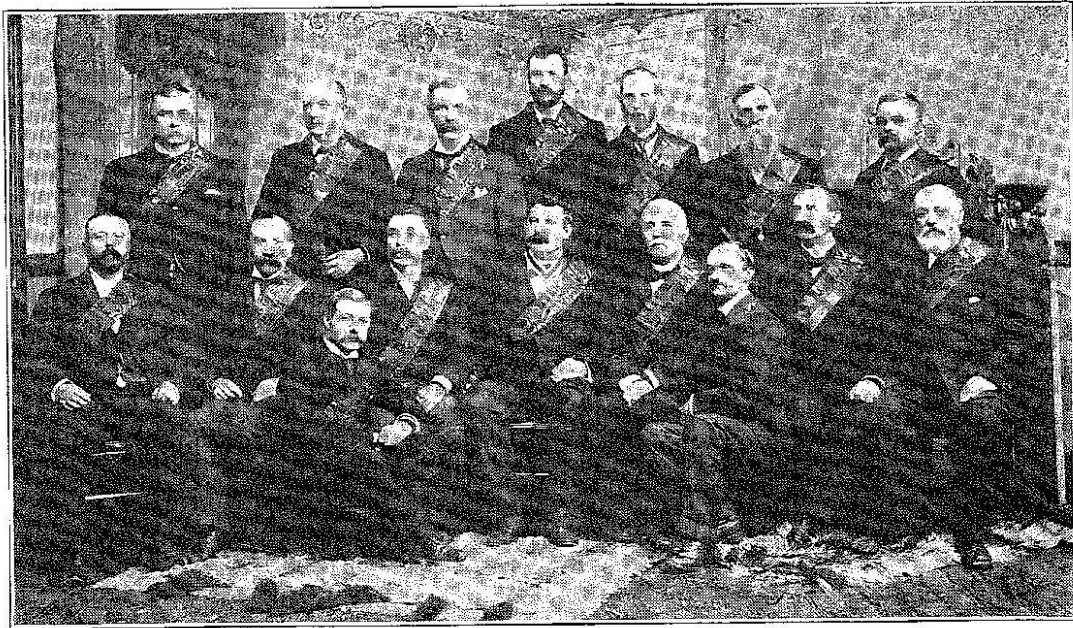
"TEMPLE" PRECEPTORY, No. 51. FOUNDATION MEMBERS.